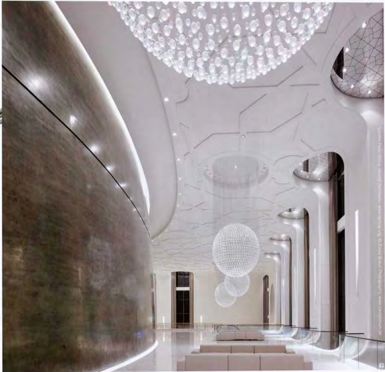
COMPTON Light GmbH, Germany, www.compton-light.com, 02243942220@compton.de, www.compton-light.com