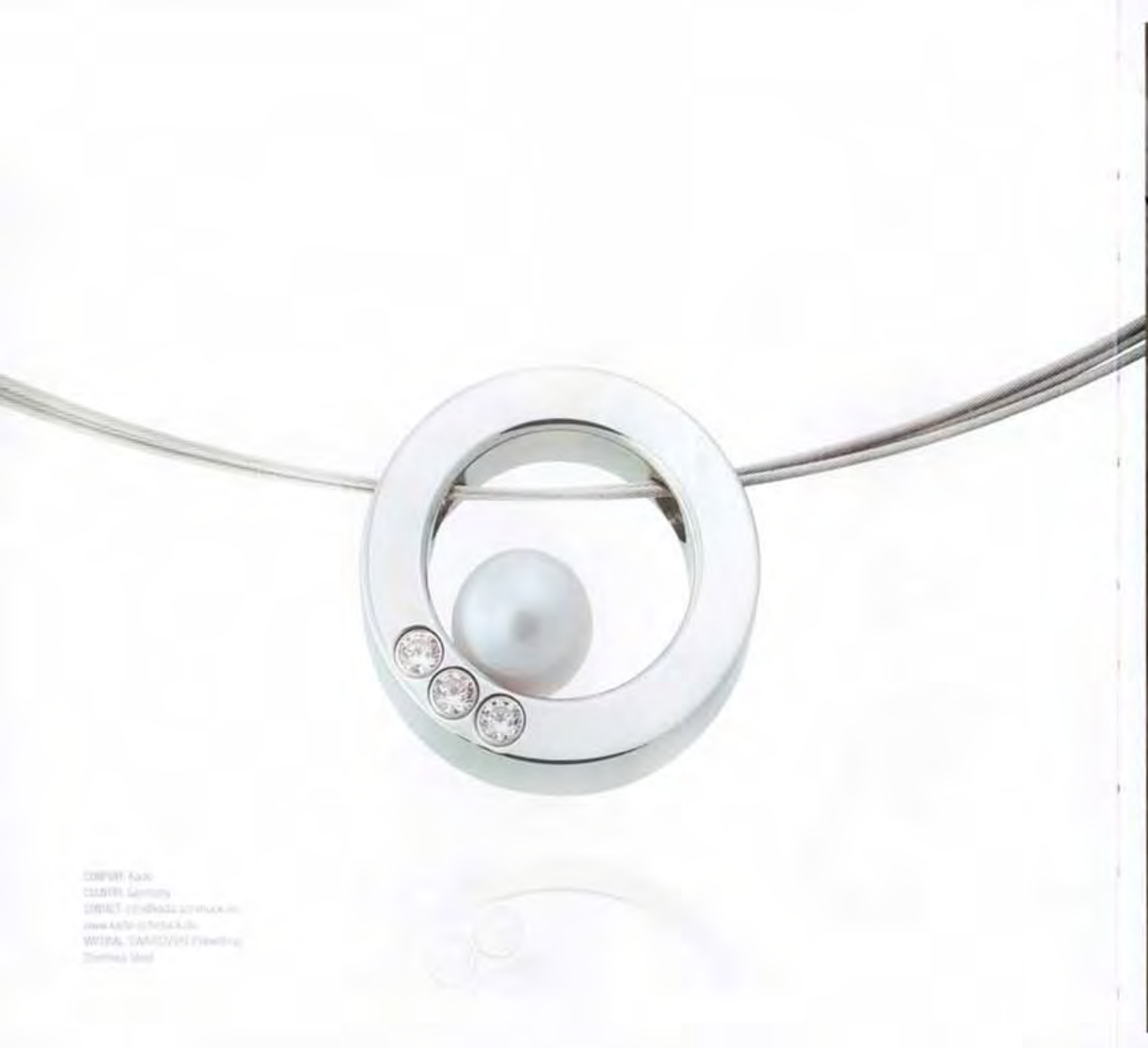
COMPTON Light COMPTON Germany CONTACT: 02243942220@compton.de www.compton-light.com WIRTSCHAFTSUNIVERSITÄT Duisburg-Essen