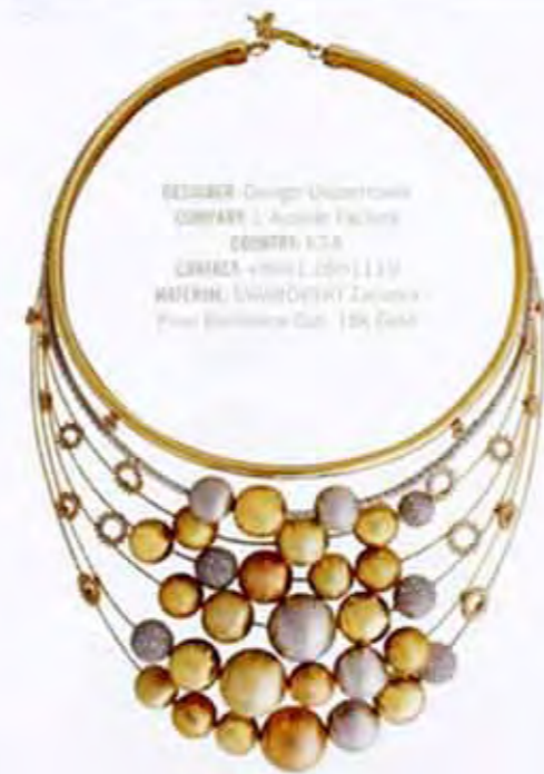
DESIGNER: Design Unifort COMPANY: L. Assolati Factory COUNTRY: SLOVAKIA ADDRESS: vlna 2, 020 11 21 MATERIAL: SWAROVSKI Zirconia Pure Brilliance Cut - 18K Gold