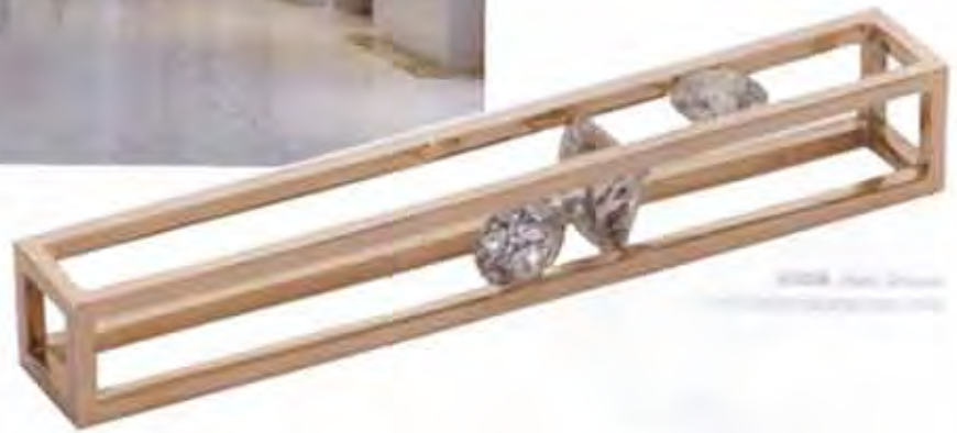
BESSA Jewellery www.bessa.com