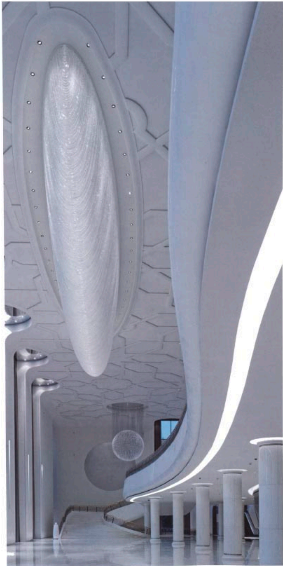
← | Main entrance with crystal chandeliers