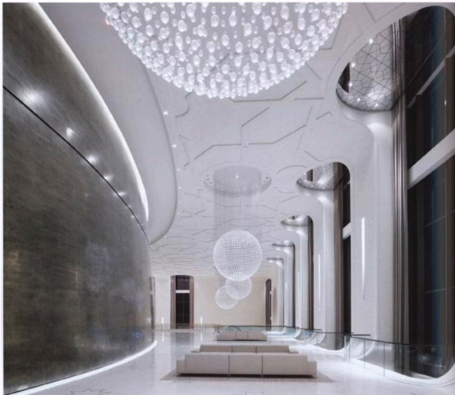
↑ | Mezzanine level in main foyer → | Banquet hall

Address: Amir Timur Square, Tashkent, Uzbekistan. Client: Republic of Uzbekistan. Completion: 2009. Gross floor area: 42,000 m 2 . Building type: congress and cultural center. Lighting technique: custom-made chandeliers, custom LED lighting objects, custom-made luminaires and LED systems. Light function: enhance the contemporary interior design with light, creating a festive glamour.